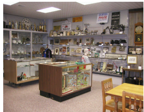
Collection in Display Room