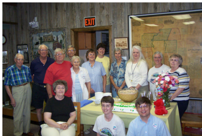
Society Members at 25th Birthday Celebration