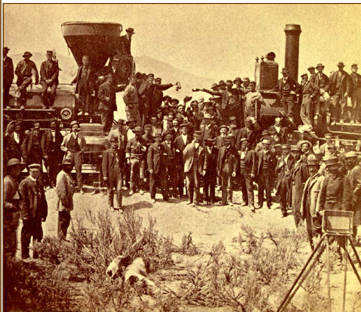
Russell's "Joining of the Rails"