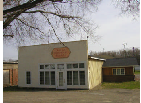
24 Portage Street