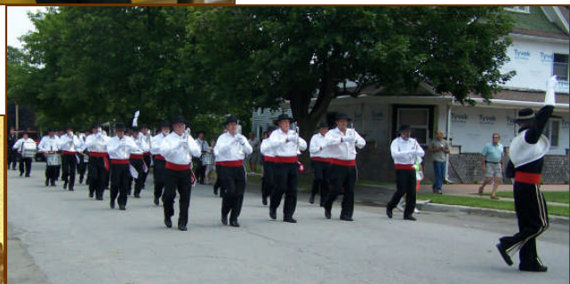
The Rancheros at Nunda Bicentennial Parade

Come to one of our "Nunda" programs this fall and stop by on a Sunday afternoon (2 pm - 4 pm) to view the exhibits.