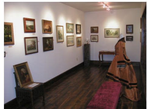
Rose M. Shave Gallery